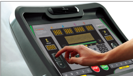
19" LED Console with toggle shifters and reading rack / tablet holder