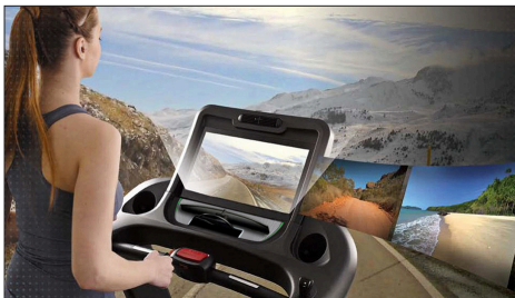
Intuitive, easy-to-use touchscreen console with Virtual Connect™ scenic videos