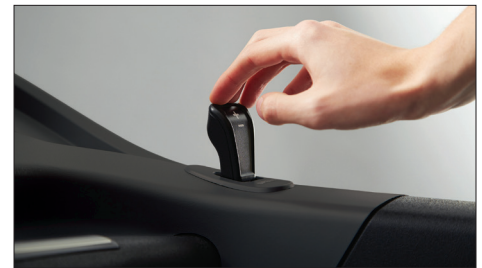
Quick speed & elevation paddle shifters